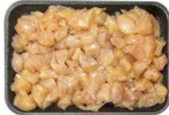
Shor Habor Chicken Stir Fry