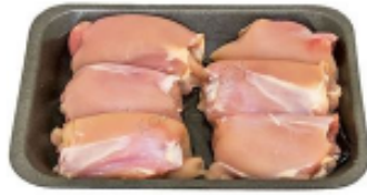
Shor Habor Baby Chicken