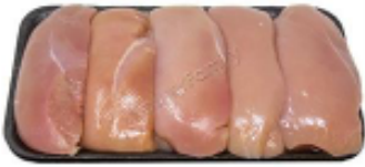
David Elliot Chicken Cutlets Family Pack $8.79 / lb