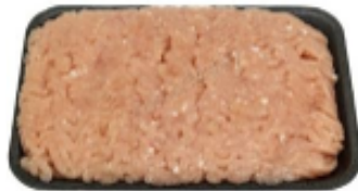
Shor Habor Ground Chicken Breast