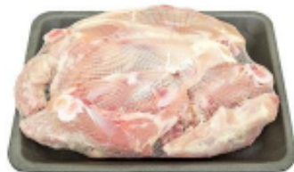
Shor Habor Netted Chicken Bones