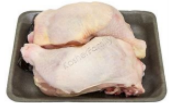
David Elliot Chicken Legs $3.79 / lb