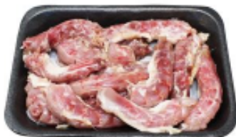
David Elliot Chicken Necks $3.49 / lb