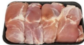
Shor Habor Dark Chicken Cutlets $9.49 / lb