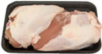
David Elliot Chicken Top No Wings