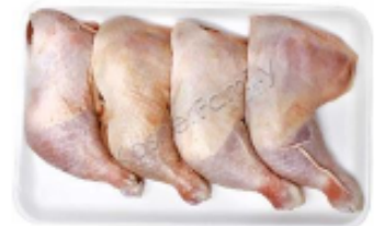
David Elliot Chicken Legs Extra Clean