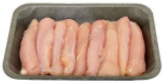
Shor Habor Chicken Nuggets $9.99 / lb