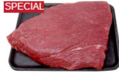
American Beef 1st Cut Brisket