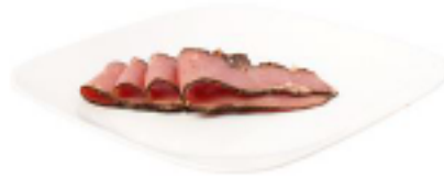
Shor Habor 1st Cut Brisket Pastrami...