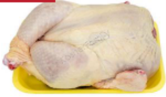
David Elliot Whole Chicken