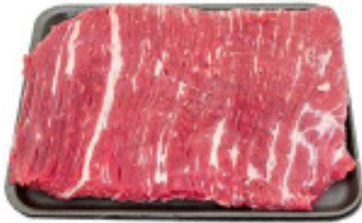
American Beef 2nd Cut Brisket