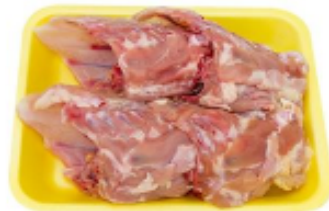
Shor Habor Chicken Bones