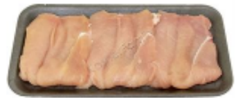
David Elliot Thin Chicken Cutlet $12.49 / lb