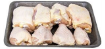
David Elliot Chicken Combo Thighs&drums