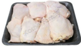
David Elliot Chicken Thighs Family Pack $4.29 / lb