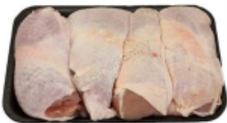
Shor Habor Chicken Capons