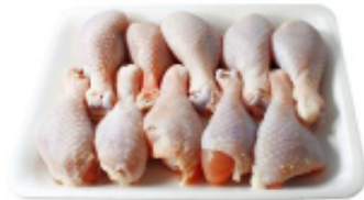
David Elliot Chicken Drumsticks Family... $4.29 / lb