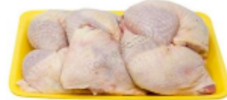
Shor Habor Chicken Legs Family Pack $3.69 / lb