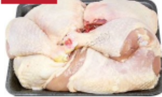
David Elliot Whole Chicken Cut In 1/8 $3.99 / lb $2.99 / lb