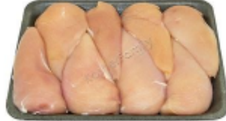
Shor Habor Chicken Cutlets Family Pack